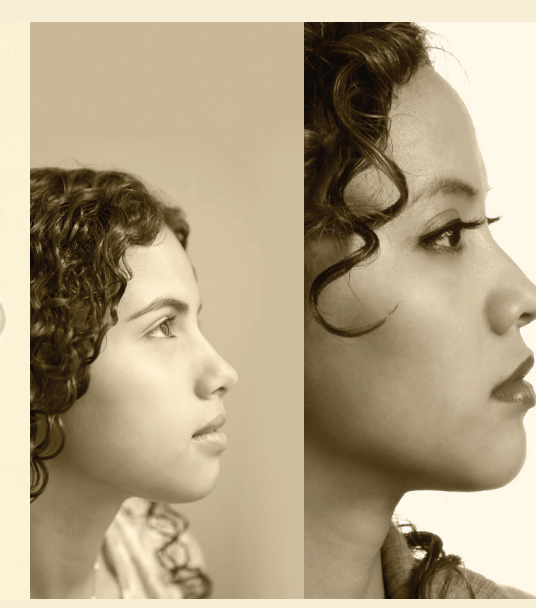
Birth to Baccalaureate