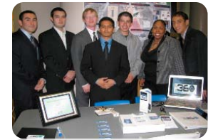
Spring 2009 Tech Start Up Winner – Automated Endoscope Cleaner