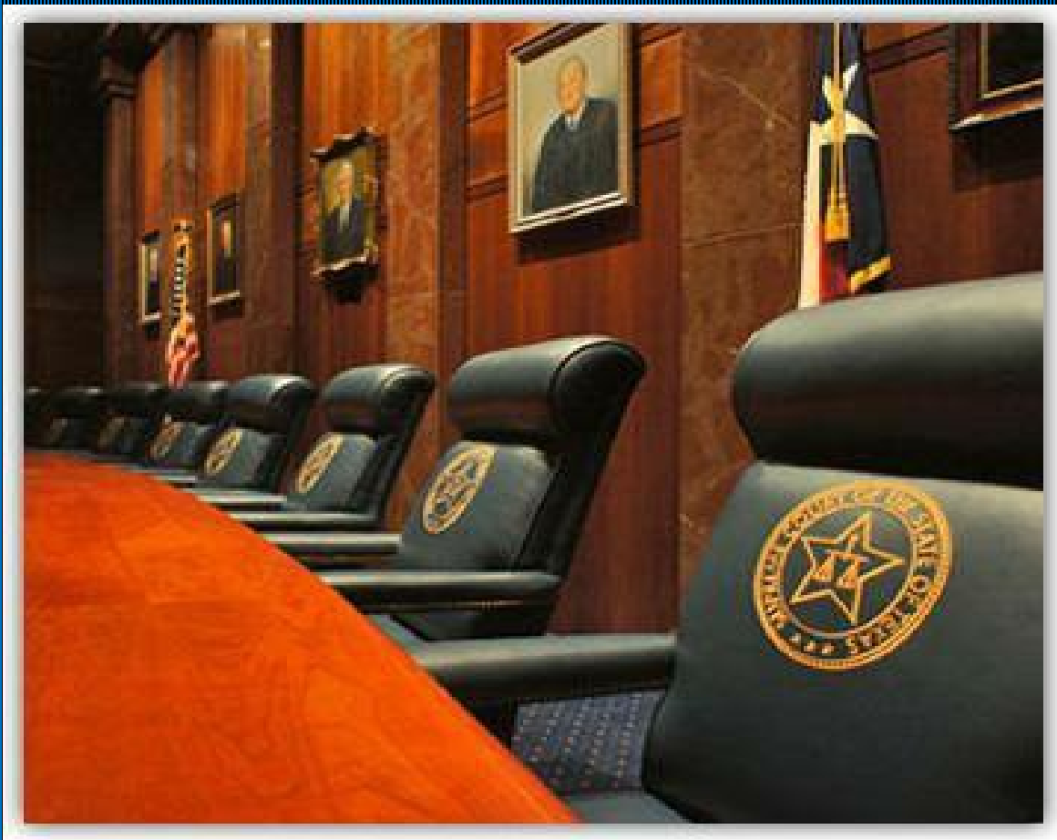
Supreme Court of Texas