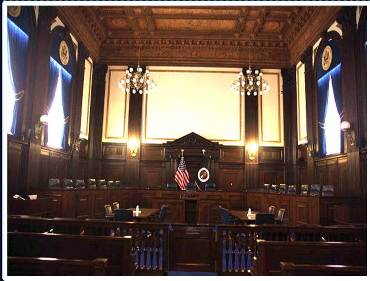
U.S. Court of Appeals